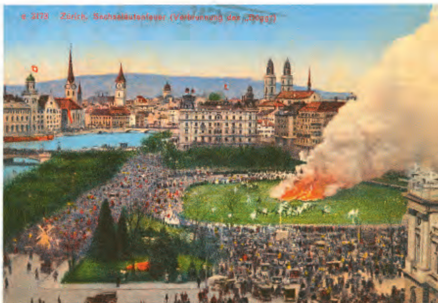
© 2023 Zürich, Sechsläutenfeier (Verbrennung des „Bögg“)